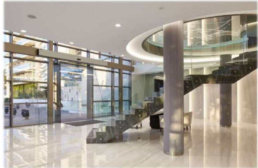
HALL GROUND FLOOR