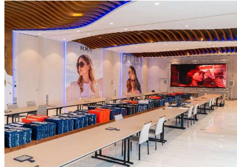
250 PEOPLE SHOW ROOM