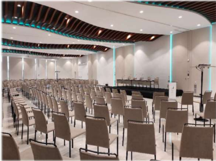
400 PEOPLE THEATER