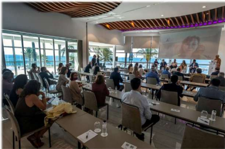
100 PEOPLE CLASSROOM