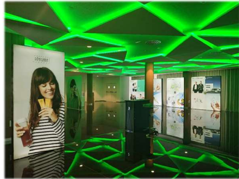
WELCOME BRANDED VINYL